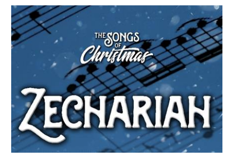
Sunday, Dec. 16 Luke 1:67-79