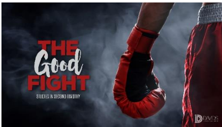
May 19, 2019 2 Timothy 3:10-16