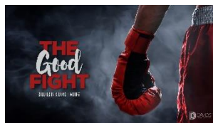
June 9, 2019 2 Timothy 4:9-22